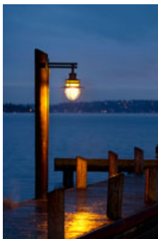
Pier (Click image to see larger version and detailst)