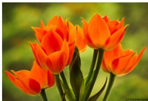
Orange Flowers (Click image to see larger version and details)